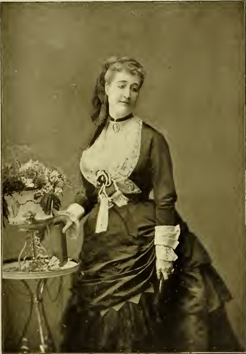
THE EMPRESS EUGÉNIE.